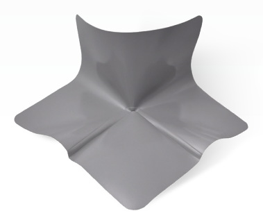
D Outside Corner