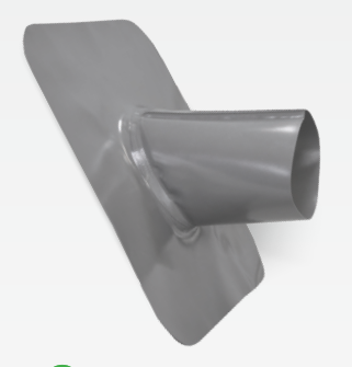
B Angled Pipe Boot